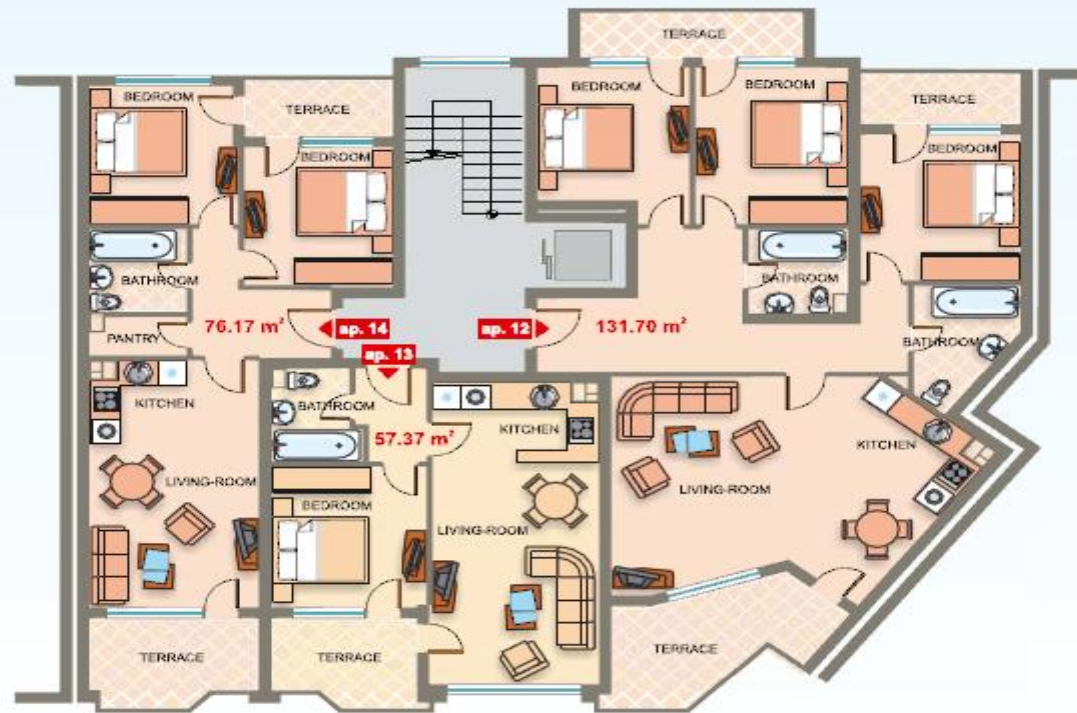
Ap. 12 – block 15